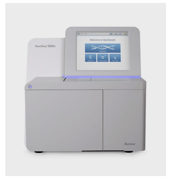
NextSeq<sup>™</sup> 550Dx System

CE-marked IVD reagents in a kitted format for simple test implementation and reliable results.