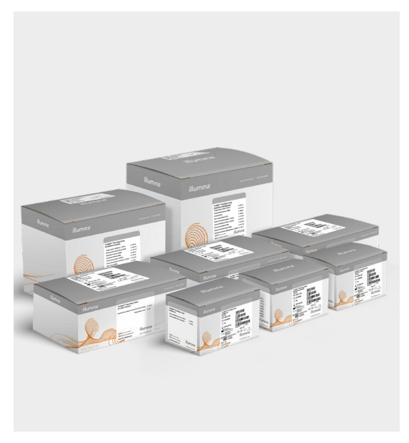
Library prep reagents

CE-marked IVD reagents in a kitted format for simple test implementation and reliable results.