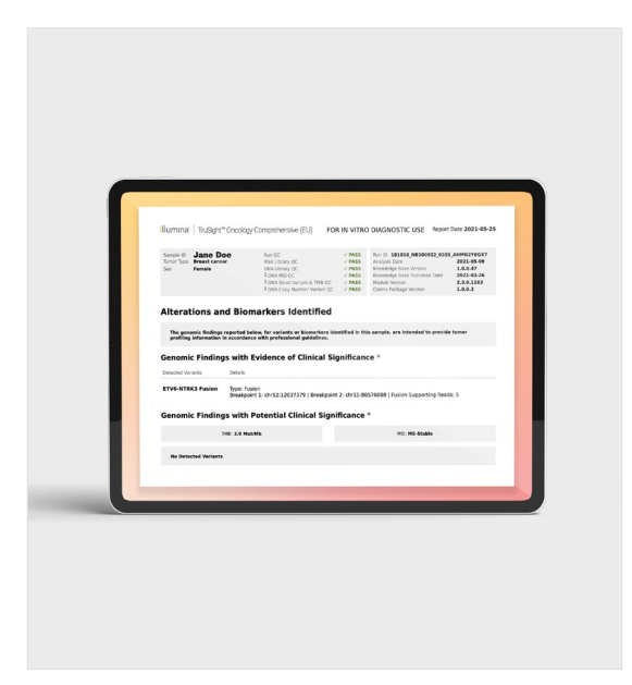
Clinical IVD report

A CE-marked IVD instrument that delivers the consistency and reliability clinical labs need.