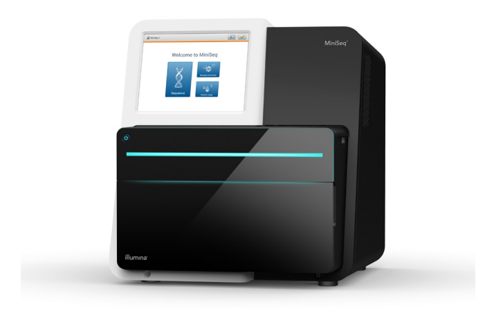
Figure 1: The MiniSeq System—By harnessing advances in SBS chemistry and simple, streamlined workflows, the MiniSeq System delivers a powerful, easy-to-use, library-to-results solution.

The MiniSeq System (Figure 1) delivers the quality and reliability of Illumina next-generation sequencing (NGS) technology in a powerful, accessible benchtop sequencer with a small footprint. This small, robust system turns a broad range of NGS methods into approachable, easy-touse research tools, enabling researchers to take control of their sequencing projects. With the MiniSeq System, there is no need to wait to batch samples for sequencing on a high-throughput instrument; researchers can sequence on demand. It circumvents the iterative, time-consuming testing of Sanger sequencing and qPCR to allow for interrogation of individual genes to entire pathways with full-gene coverage. Laboratories of any size can perform a range of sequencing methods to deliver results and advance their research.