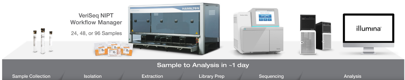
Figure 1: Full IVD NIPT workflow—VeriSeq NIPT Solution v2 provides everything needed for NIPT using NGS, including reagents for DNA extraction, library prep, and sequencing; instrumentation to automate library prep and sequencing with Workflow Manager software; an onsite server for secure data storage and analysis; and data analysis software capable of generating a report that provides qualitative results.

VeriSeq NIPT Solution v2 is validated to determine clinical accuracy and reliability. A clinical validation study was performed with samples from affected pregnancies that were eligible for testing if clinical outcomes were available and met sample inclusion criteria. The cohort comprised gestational ages of at least 10 weeks, samples with low fetal fractions, and twin pregnancies. The study screened > 2300 maternal samples with known outcomes for trisomy 21, trisomy 18, trisomy 13, RAAs, partial duplications and deletions \geq 7 Mb for all autosomes, and SCAs using VeriSeq NIPT Solution v2, and compared the