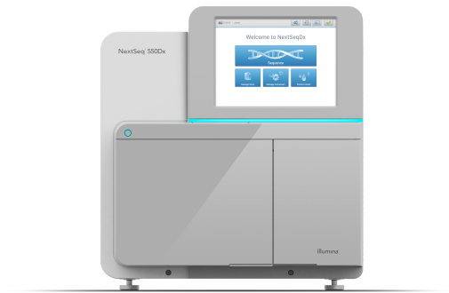
Figure 1: The NextSeq 550Dx Instrument —By leveraging the latest advances in SBS chemistry and user-friendly, regulated workflows, the NextSeq 550Dx instrument delivers high-quality results for both clinical and research applications.

While the NextSeq 550Dx instrument can generate more than 90 Gb of data in less than two days, it also delivers the consistency of a regulated platform and includes robustness improvements in software and instrument design. In addition, running in Research Mode supports all currently available NextSeq 550 System research applications including exome sequencing, transcriptome profiling, customer-designed targeted panels, and microarray scanning. With the NextSeq 550Dx instrument, clinical laboratories can run in