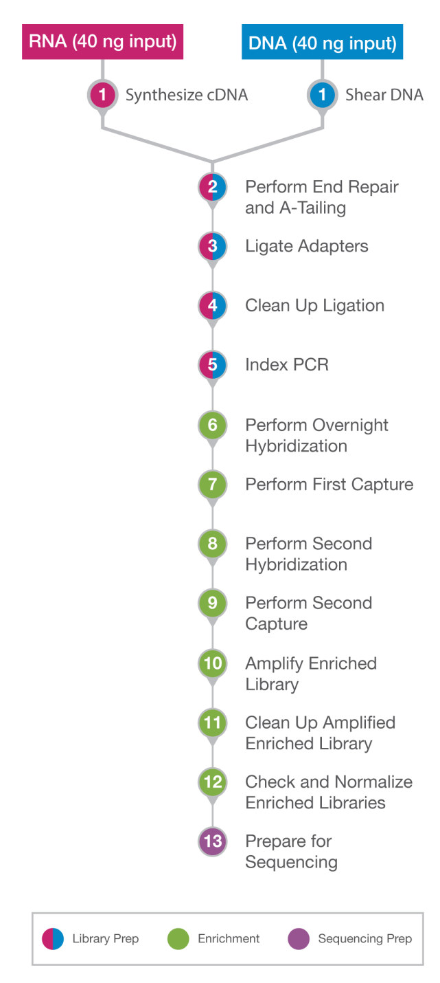
Figure 2: Combined Library Prep Workflow - The DNA and RNA samples follow the same workflow, after the cDNA synthesis step (for RNA) and the shearing step (for DNA).