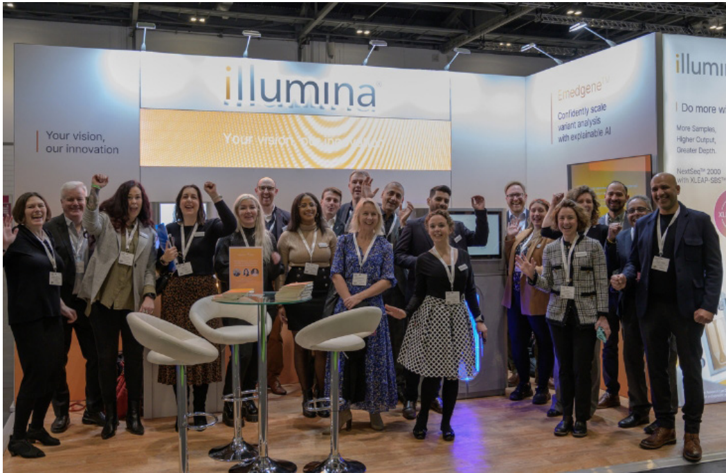
Watch a video of highlights from the event at https://www.youtube.com/watch?v=aom9HP2o3VQ