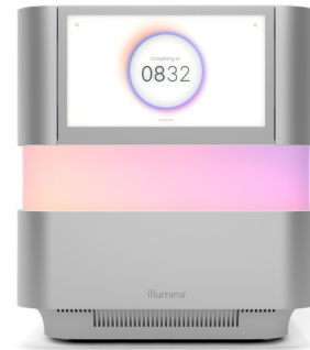
Figure 1: NextSeq 1000 and NextSeq 2000 Sequencing Systems—The NextSeq 1000 and NextSeq 2000 systems harness the latest advances in SBS chemistry and streamline sequencing workflows.