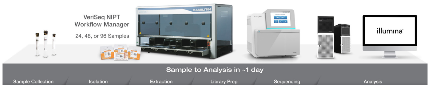
Figure 1: Full IVD NIPT workflow—The VeriSeq NIPT Solution v2 provides everything needed for NIPT using NGS, including reagents for DNA extraction, library prep, and sequencing; instrumentation to automate library prep and sequencing with workflow manager software; an onsite server for secure data storage and analysis; and data analysis software that generates qualitative result reports.

VeriSeq NIPT Solution v2 is validated to ensure clinical accuracy and reliability. Samples from affected pregnancies were eligible for testing if clinical outcomes were available and met sample inclusion criteria. The cohort comprised gestational ages of at least 10 weeks, samples with low fetal fractions, and twin pregnancies. The study screened over 2300 maternal samples with