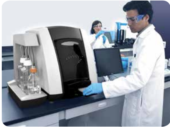
Figure 2: VeraCode MicroBead