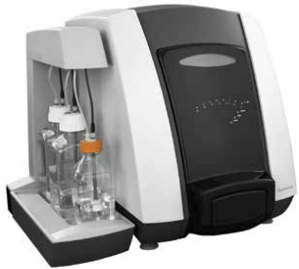
Figure 1: BeadXpress Reader

The Illumina BeadXpress Reader employs a dual-color laser detection system to identify and analyze each VeraCode microbead.