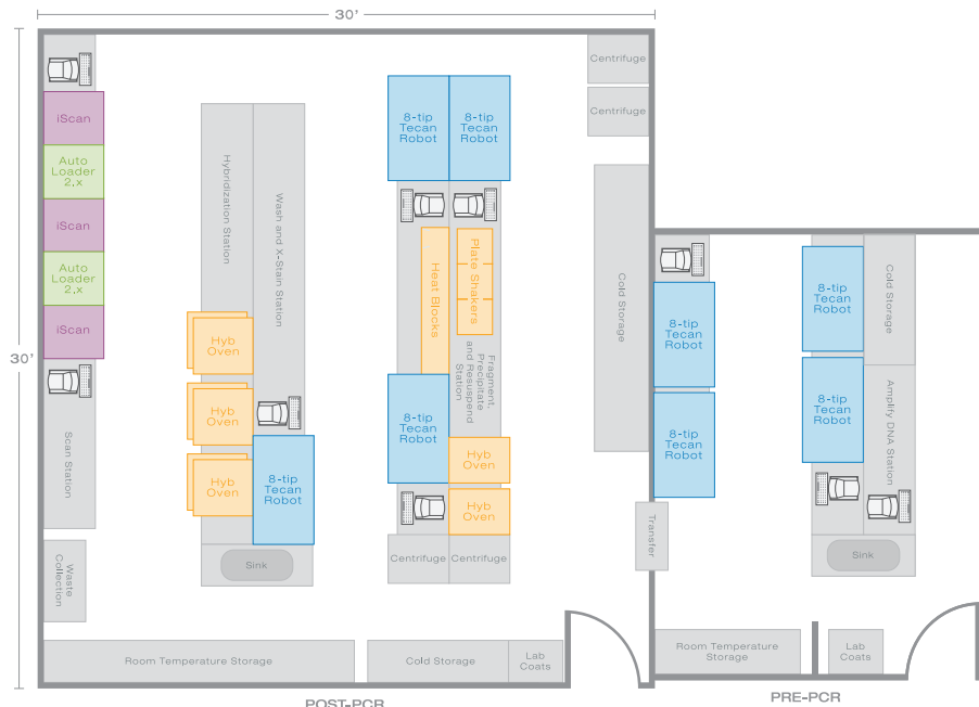
Figure 3: Example lab layout for Infinium XT production-scale genotyping—An example lab layout is provided for processing 1,000,000+ samples per year and includes: three (8-tip) Tecan robots, three iScan Systems, two AutoLoader 2.x units, and ancillary lab equipment. This example layout requires approximately 1200 square feet. Layout is not to scale.

With the high-throughput Infinium XT solution, there is a natural increase in data analysis. With this in mind, several improvements have been made to GenomeStudio™ Software and Beeline Software. GenomeStudio Software is the Illumina visualization and analysis program for microarray-based genotyping data. It provides a tabular view for quickly accessing all the data in an experiment and allows data to be exported for use by various third-party applications. The GenomeStudio Genotyping Module supports analysis of Infinium array genotyping data with normalization, genotype calling, clustering, data intensity analysis, and more. In addition, GenomeStudio Software is necessary for creating and modifying clusters used for calling genotypes from scanned microarray signal intensities. GenomeStudio 2.0 Software speeds up genotype cluster generation, reducing the overall analysis turn-around time. Also, the Polyploid Genotyping Module is appropriate for agricultural and other applications involving polyploid organisms (Figure 4). When used in tandem with Illumina LIMS, GenomeStudio Software provides an integrated experience to view and analyze data from processed samples in real time.